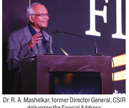
delivering the Special Address