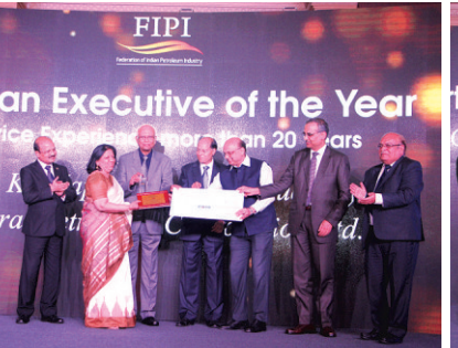
Petroleum Corporation Limited. – Recipient The FIPI 'Woman Executive of the Year' Award (More than 20 years experience)