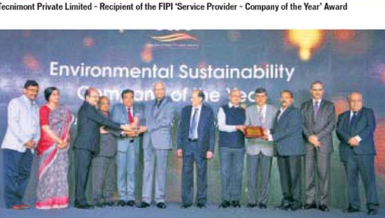
Oil and Natural Gas Corporation Ltd - Recipient of the FIPI 'Environmental Sustainability - Company of the Year' Award