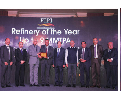
Bharat Oman Refinery Limited – Recipient of the FIPI 'Refinery of the Year' Award