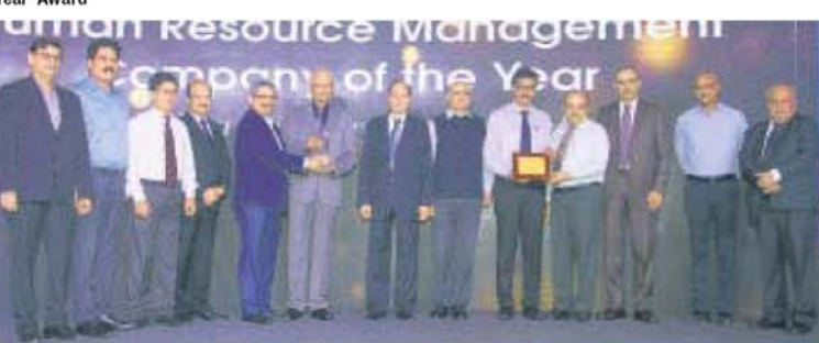
Indian Oil Corporation Limited - Recipient of the FIPI 'Human Resources Management - Company of the