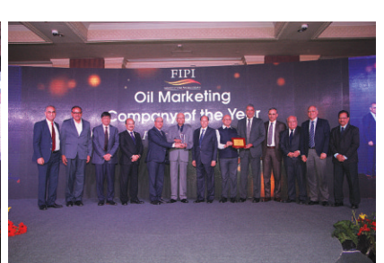
Hindustan Petroleum Corporation Limited -Recipient of the FIPI 'Oil & Gas Marketing Company of the Year' Award