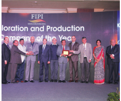
Oil and Natural Gas Corporation Ltd - Recipient of the FIPI 'Exploration & Production - Company of the Year' Award