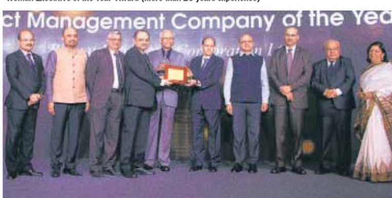
Bharat Petroleum Corporation Limited - Recipient of the FIPI 'Project Management - Company of the Year' Award

pressreader PressReader.com +1 604 278 4604