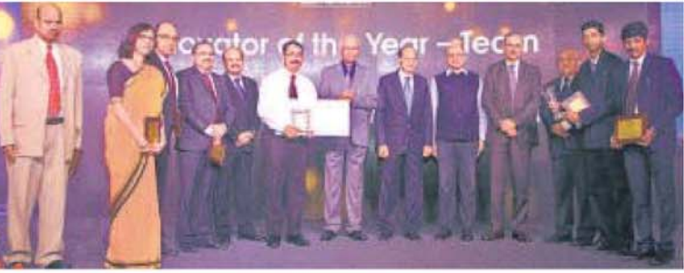
Research & Development Centre of Indian Oil Corporation Ltd. - Recipient of the FIPI 'Innovator of the