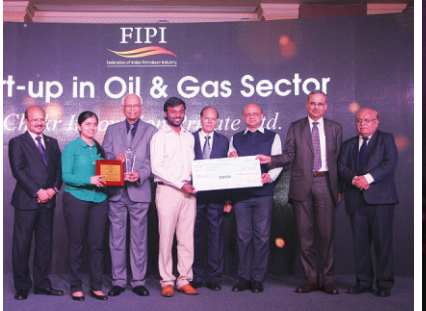
'Start-up in Oil & Gas Sector'Award