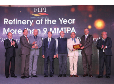
Panipat Refinery of Indian Oil Corporation Ltd. -Recipient of the FIPI 'Refinery of the Year' Award