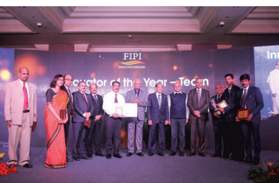
Research & Development Centre of Indian Oil Corporation Ltd. - Recipient of the FIPI 'Innovator of the Year' Award