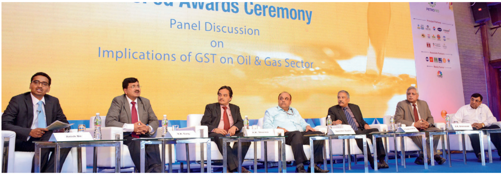
Panel discussion on implications of GST on oil and gas sector was thought provoking and industry experts put forth their point of view while interacting