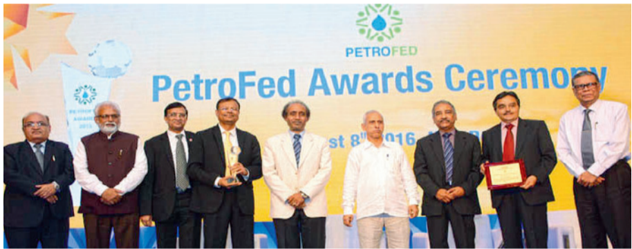
PetroFed instituted oil and gas industry awards are given for various categories

the petroleum industry will take a major hit in the form of stranded taxes as input credit would not be available in the hybrid regime of taxation. Compliance challenge in a dual regime was another issue highlighted by the panelists.